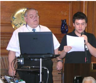
Celebrating Veteran's Day....