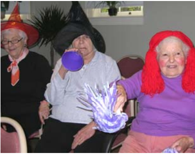
Enjoying the Halloween Festivities!!