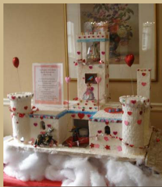
Our lovely Love Castle