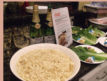
To ring in the New Year, we studied the symbolism of various foods of the world, then prepared and enjoyed them together