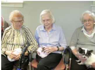
At left. A visit from Barn Babies!