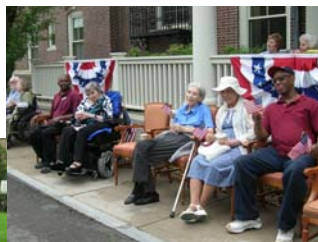
Celebrating Memorial Day!