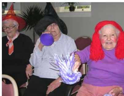
Enjoying the Halloween Festivities!!