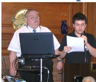
Celebrating Veteran's Day....