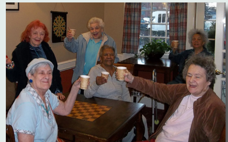
Our residents getting festive at Happy Hour!