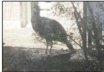
Ever since we had the backyard certified as a Wildlife Habitat, all kinds of creatures have shown up. This female wild turkey spent an entire day!