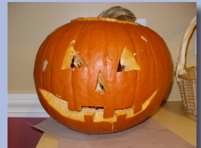
for roasting; right: the finished Jack-o'-Lantern masterpiece!