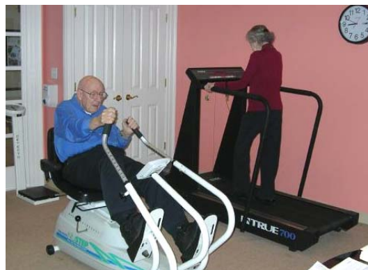
Some of Our Residents taking advantage of the exercise equipment in the Keiser Exercise Room!