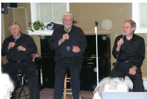
The Three Swingin Tenors performed for the February birthday celebrants along with residents and staff. Singing songs from the 40's 50's and a few 60's tunes, everyone joined in the fun.

We have been very busy here at The Cambridge Homes. Here is a just a taste of what's been going on!